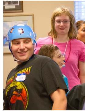
Whitmer High School