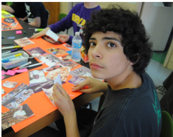
Bryan High School