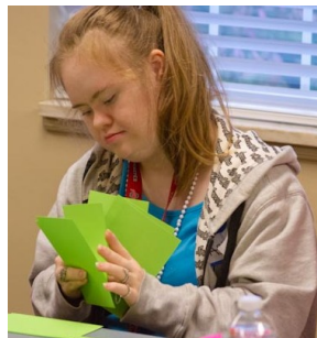
Whitmer High School