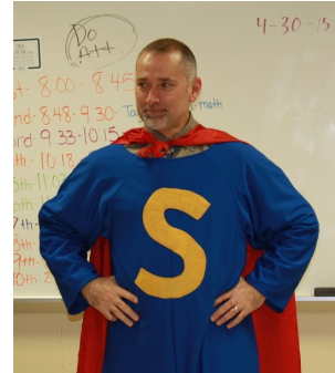
Mohawk High School