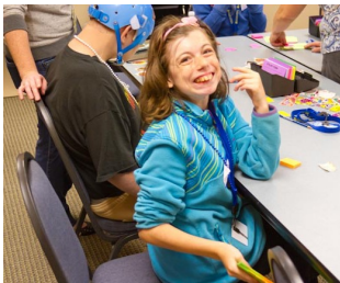
Whitmer High School

It's My Turn is a self-determination curriculum for students with disabilities in middle school and high school. Developed by OCECD through funding from the Ohio Rehabilitation Services Commission, and currently supported by the U.S. Department of Education, Office for Special Education Programs' PTI funds and OCECD funds, the workshops contain five parts: Read more}