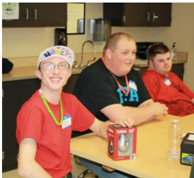
Mohawk High School

I can do anything In this journey called life Laugh, live, celebrate... Soar to new heights, For the world seems a better place When I seize each new day And as I journey I will remember: Happiness comes most to those who give it away.