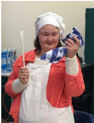
Coldwater Transition Unit Mercer Co. ESC

Please read below to find out how one student at the parent event shared what she took away from her experience with the It's My Turn training.