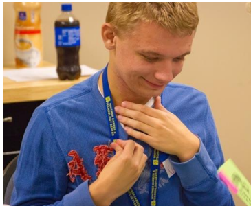
Whitmer High School

I can do anything I set my mind to I can make dreams happen By the things that I do. Thinking positively no matter what Today and everyday For it's all in how I look at things And what's put into play.